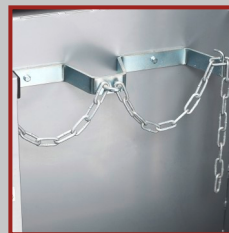
Safe holder for CO2 cylinders