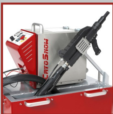
Storage hose package and blasting pistol holder