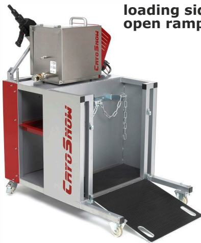
loading side with open ramp