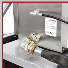
90° connections for compressed air and CO2