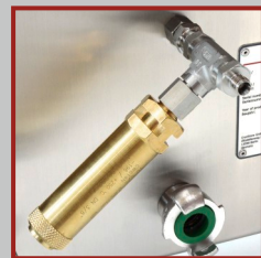
Supply connections for air and CO2 with safety valve