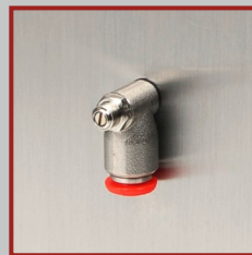
Compressed air after flow manually adjustable