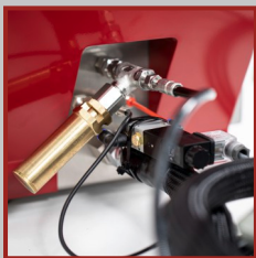
Hose package connection with 24V solenoid valve and CO2 safety valve